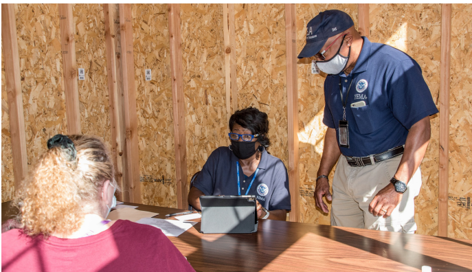
A FEMA Disaster Survivor Assistance (DSA) crew helps wildfire survivors in Stayton, Ore. - September 27, 2020